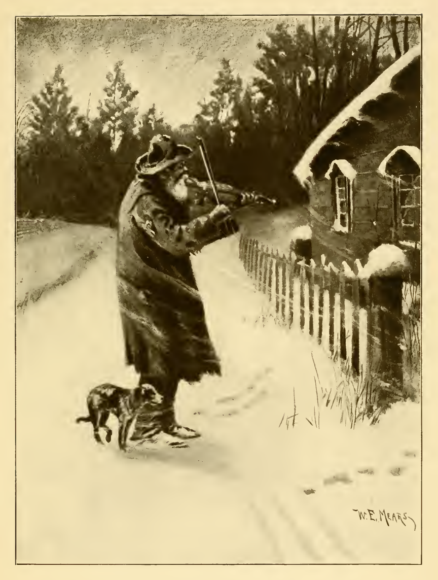
An Ethiopian Santa